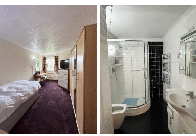
Please note: Some furniture items have been removed from the property